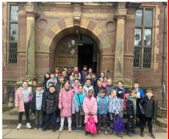
Newhampton Federation children at Condover

It was clear to see that they were having a brilliant time... but no doubt they will be ready for a good night's sleep this evening!