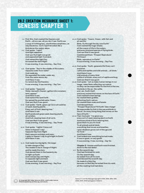
GENESIS CHAPTER 1