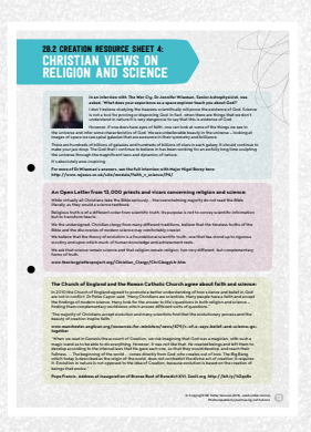
CHRISTIAN VIEWS ON RELIGION AND SCIENCE