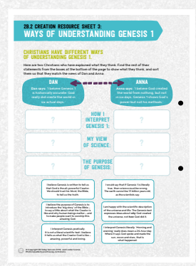
WAYS OF UNDERSTANDING GENESIS 1