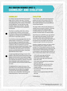
COSMOLOGY AND EVOLUTION