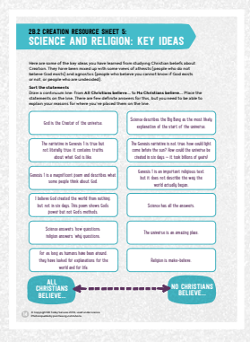
SCIENCE AND RELIGION: KEY IDEAS